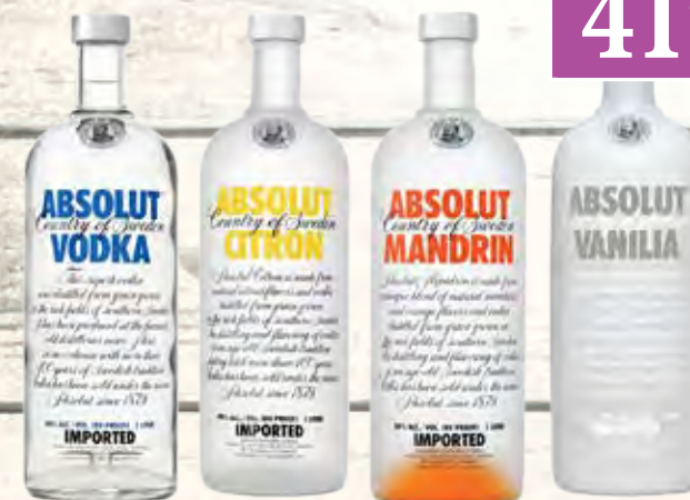
Absolut vodka flavors 75 cl