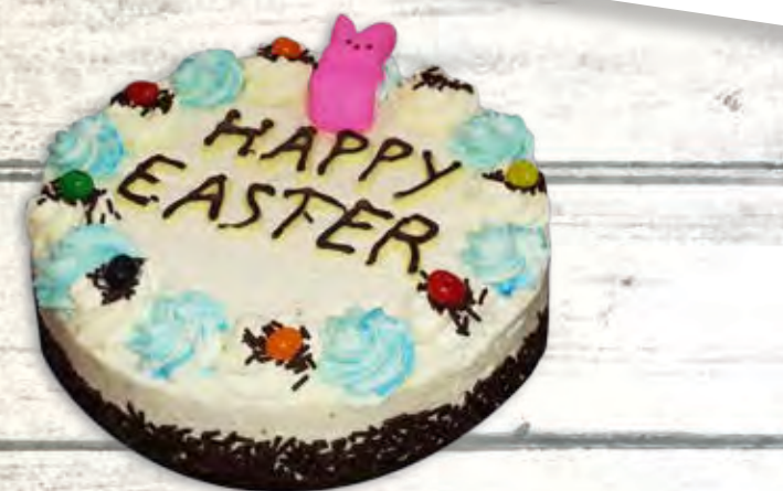
Easter Whipped cream cake Great variety of easter whipped cream cakes available this easter...made fresh in our very own bakery!