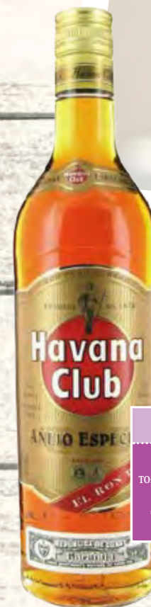
Havana club añejo Rum 70 cl