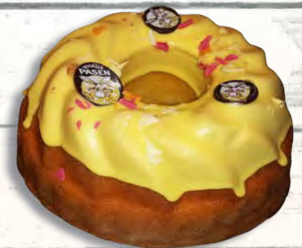
"Tulband" Easter Cake Small and large tulband cakes available in store!

Easter specials valid till March 28th while supplies last. All prices are in aruban florins excluding taxes.