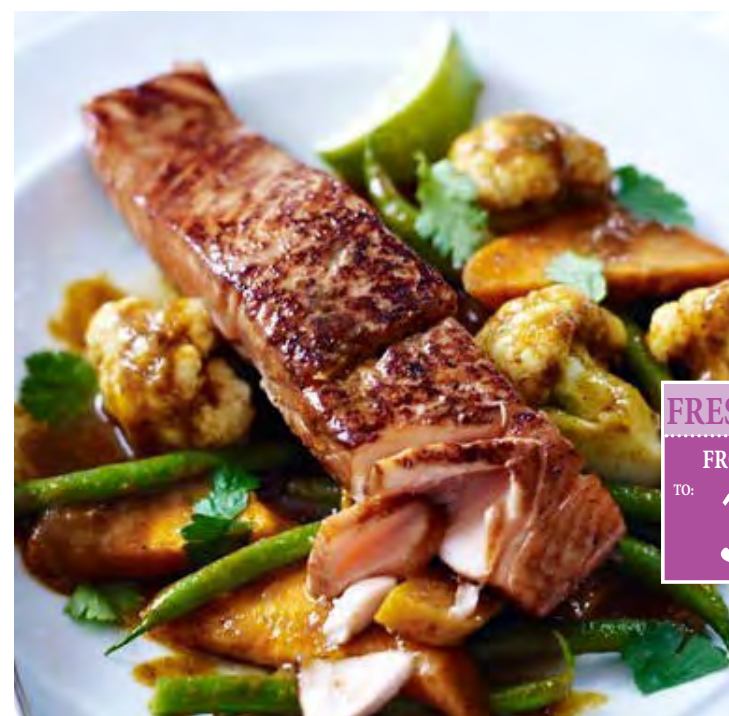
Salmon in argentine sauce per 100 gr

FRESH DEALS FROM 4.87 afl. TO: 3.99 Avg.