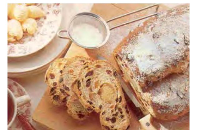
Easter bread "Paasstol" Great variety of easter breads available in store!